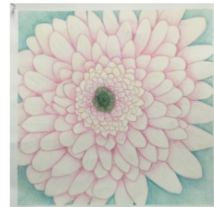
FEATURING ART BY: LINSDEY UGANISKY